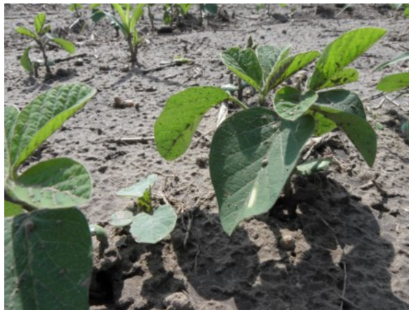
15 days following planting, 7/10/2013