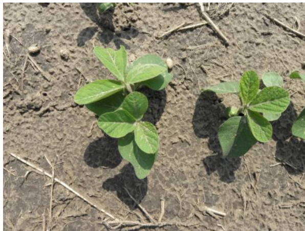
15 days following planting, 7/10/2013