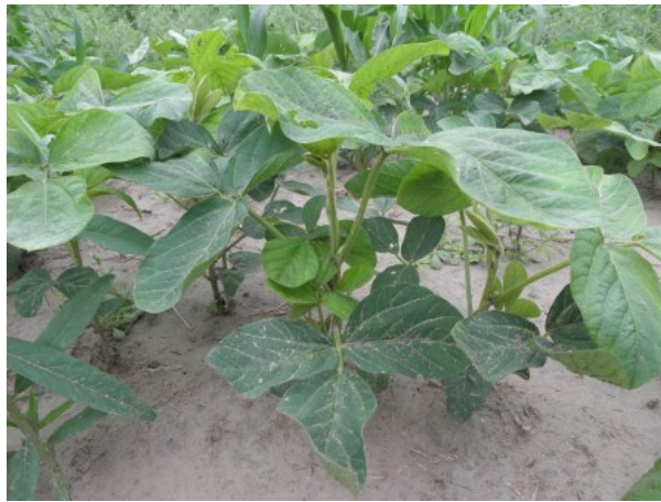
30 days following planting, 7/25/2013