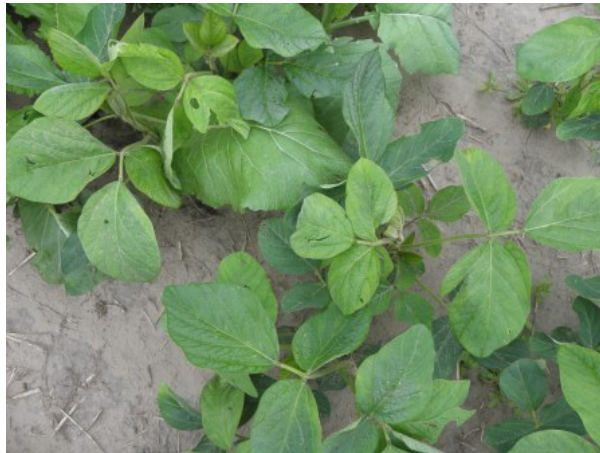
30 days following planting, 7/25/2013