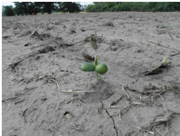
6 days following planting, 7/1/2013